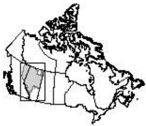
MAP 4 Access Densities in the Western Canadian Sedimentary Basin (WCSB)